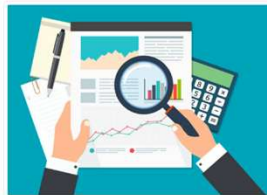
TPJA Empanelment and PNGRB TPCA Regulations