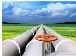
Pipeline Monitoring, Capacity and Incident Analysis