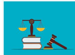
e-Court / e-filing of Board Cases